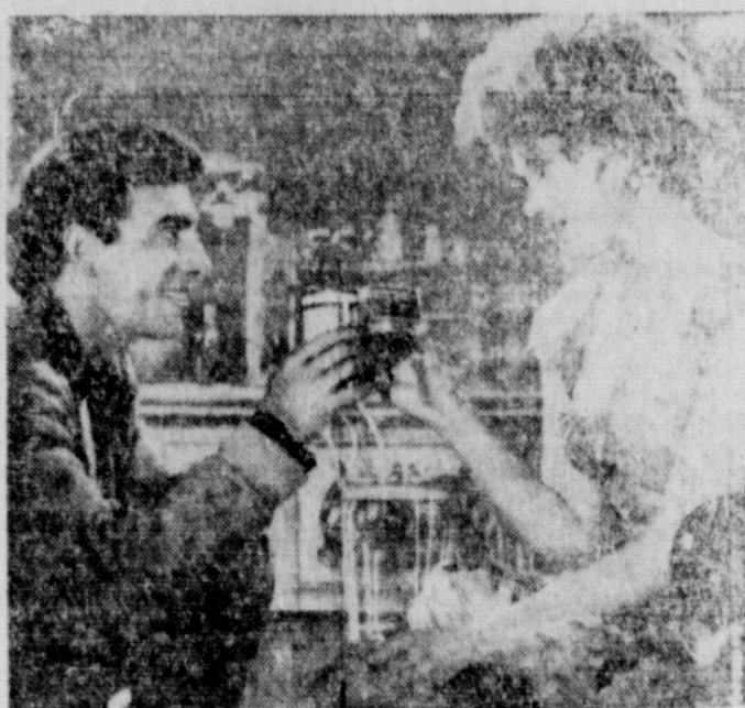
Tony Franciosa cheers up newlywed Jane Fonda by telling her that her unexpected marital problems with hubby Jim Hutton only require a period of adjustment. The scene is from Metro-Goldwyn-Mayer's "Period of Adjustment," screen version of Tennessee Williams' first comedy, which scored a big hit on Broadway.