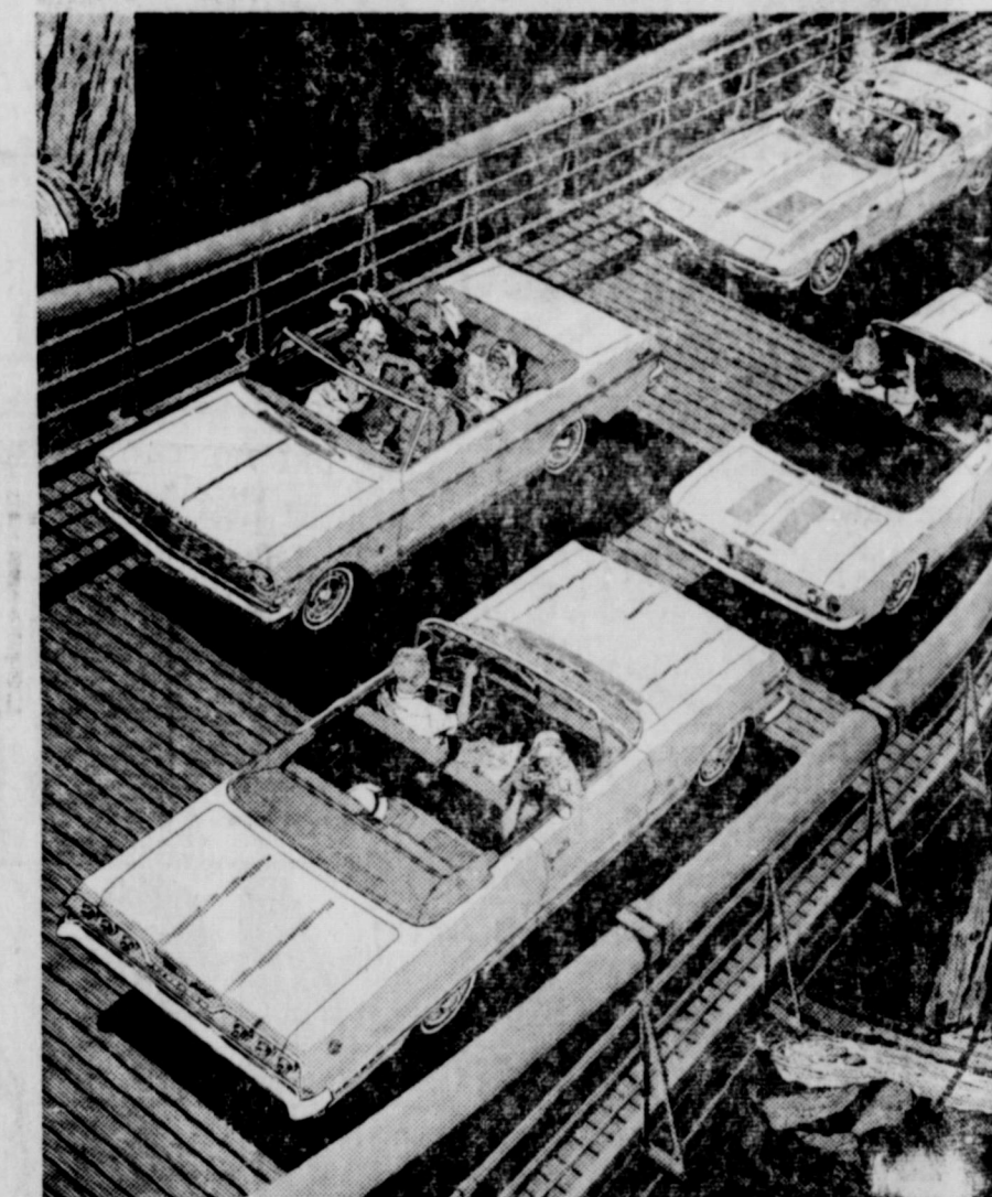
Clockwise from bottom: Jet-smooth Chevrolet Impala, Chevy II Nova 400, Corvette Sting Ray, Corvair Monza Spider

North American Philips Co., Inc. 100 East 42nd St. New York 17, New York