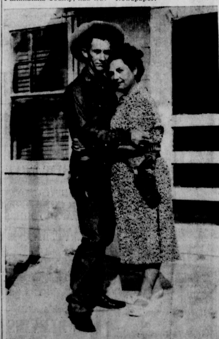
THE LONE RIDER. PLUS ONE