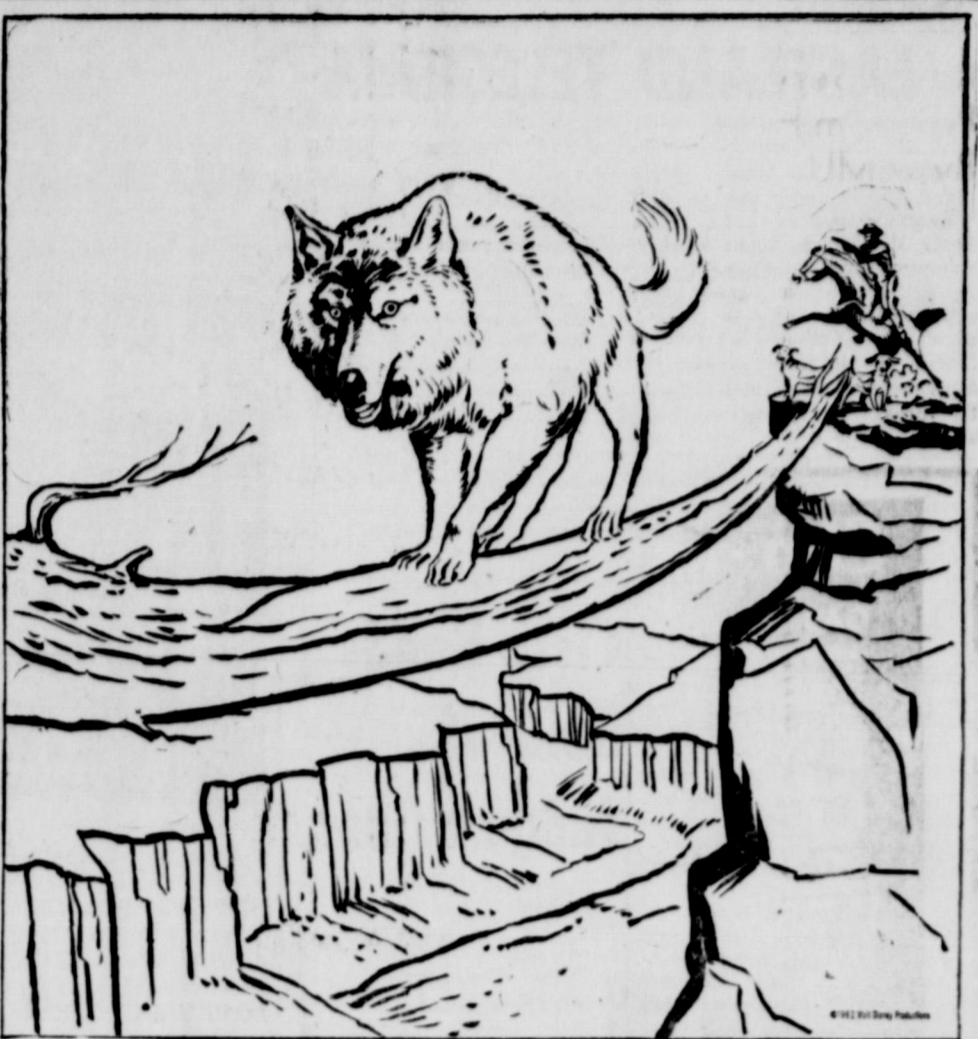
COLOR FUN —This is a lobo. He is the star of a Walt Disney movie called "The Legend of Lobo." The movie will show Thanksgiving Day at the Majestic Theater in Eastland (that's next Thursday). Color the picture of the lobo. Free passes will be given to the first 25 youngsters who bring the colored picture to the newspaper office.

WHAT CAN I DO to lead my child to the deepest love and strongest loyalty to the church? I cannot guide her steps aright without the help of the church and its message. LOYALTY TO THE CHURCH is inspired in some measure by the church itself. I realize that. By showing interest in my child, giving special instruction to her heart, special impressions to her mind, and special inspiration to her life, the church can challenge her lasting loyalty. MY HOME REGULATES my child's attitude toward the church. My own parental indif-