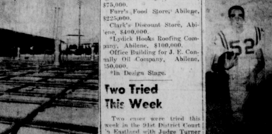
STEEL IN PLACE

Eastland Memorial Hospital is undergoing a third phase of an expansion program which will, in a three-year period, triple the patient bed capacity and enlarge the kitchen, offices and nurses quarters.