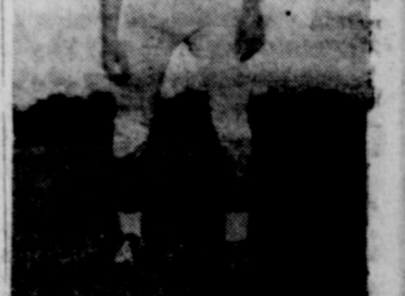
WAYNE WALDON ... 140 lb. back

Graham raced with the ball, saw it touched by a Bulldog (Continued On Page Eight)