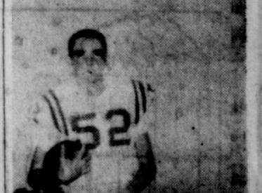
TWO TRIED THIS WEEK