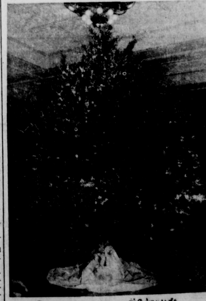
COUNTY CHRISTMAS TREE ... in Courthouse Lobby