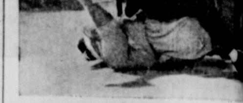
Jerry Lewis is shown above in a scene from "Minding the Store," which will be at the Majestic Dec. 25-28.

NOTICE TO PUBLIC — Any erroneous reference to the character, standing or reputation of any person or corporation which may appear in the columns of this newspaper will be gladly corrected upon presentation to the attention of the publishers.