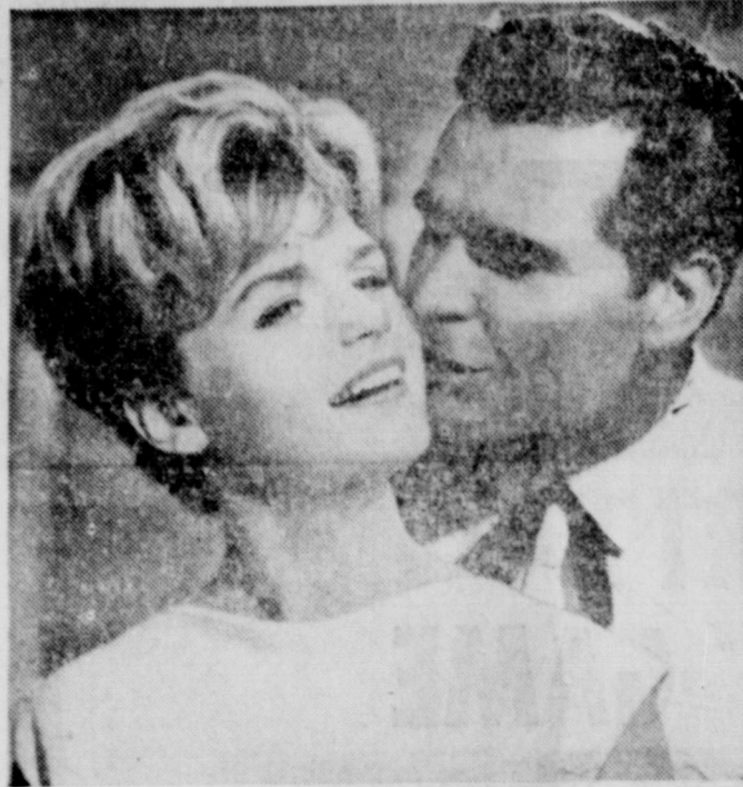
It's love and laughs, plus a bit of larceny, with Lee Remick and James Garner in Metro-Goldwyn-Mayer's "The Wheeler Dealers," hilarious spoof of Wall Street, lady brokers and a con man who takes both for a ride! Phil Harris, Chill Wills, Jim Backus, Louis Nye, John Astin, Elliott Reid and Patricia Crowley co-star in the new Panavision and color comedy.

A — The increase will be mailed out in October. This will be a special check. The regular October check will contain the usual amount. Starting in November the checks will be at the new rates.