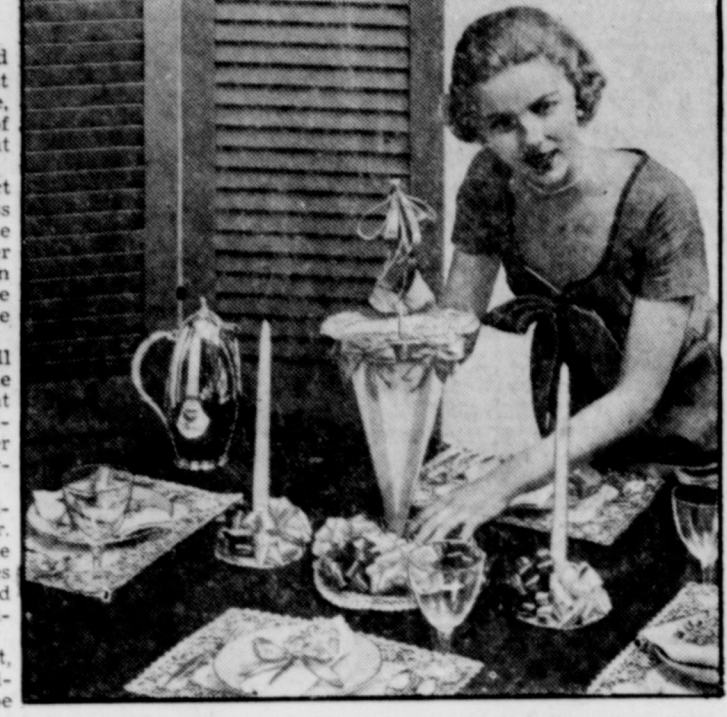
Compliments will rain down on you for a silver lace-paper doily parasol centerpiece such as this, if you're giving a bridal shower, Silver mats carry out the parasol theme.

edge of doilies so they will fan point with tissue paper to insure varied colors.