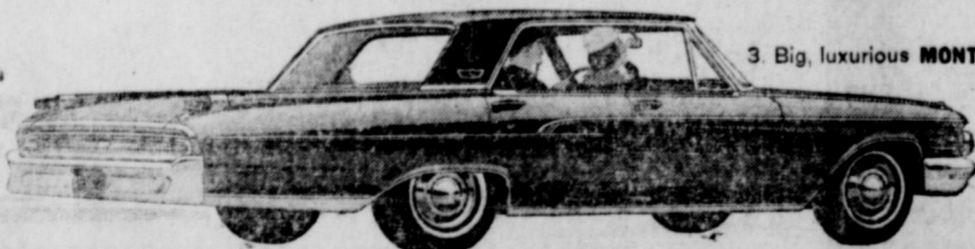
3. Big, luxurious MONTEREY