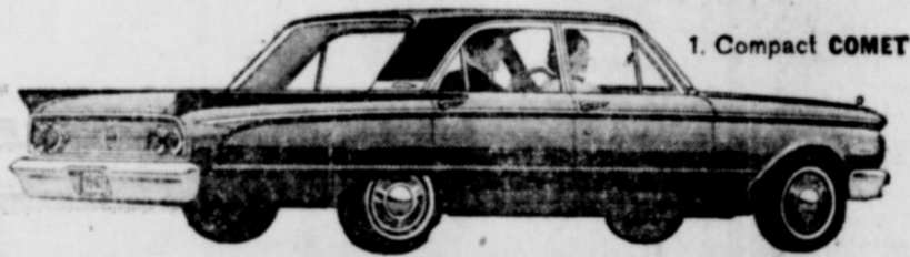
1. Compact COMET