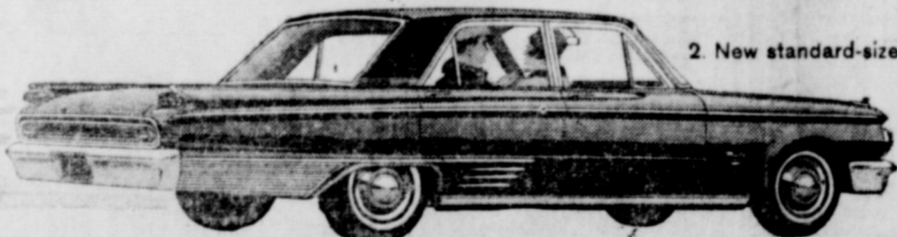
2. New standard-size METEOR