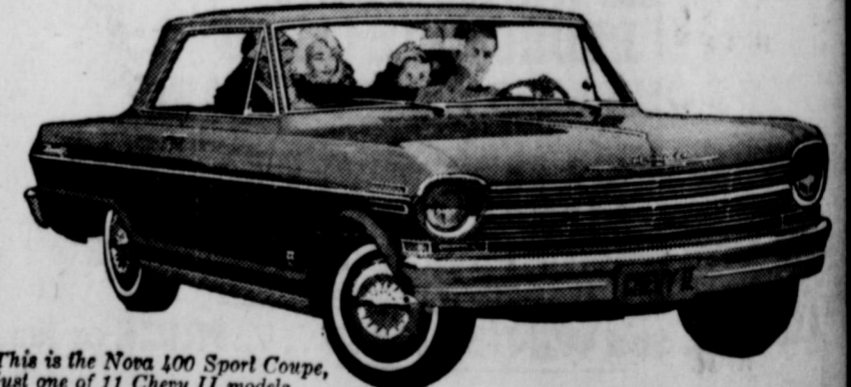
This is the Nova 100 Sport Coupe, just one of 11 Chevy II models you can pick from.

The men who know cars best put Chevy II to the test. And, after they had compared it with the rest of the '62 crop, the editors of Car Life magazine picked Chevy II for their coveted Engineering Excellence Award.