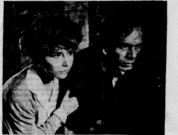
HOUNDED at every step as they undertake a dangerous mission behind the Iron Curtain, Richard Widmark and Sonja Ziemann cautiously attempt to escape from the quarters where they have been under house custody in this scene in "The Secret Ways." The Health-Universal-International film is based on Alistair MacLean's best-selling novel of international espionage.