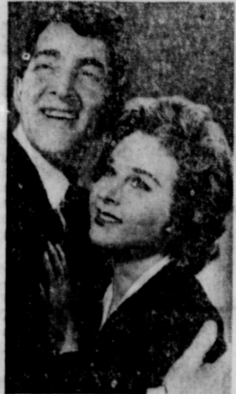
Susan Hayward and Dean Martin co-star for the first time in Metro-Goldwyn - Mayer's "Ada", unusual love story played against a beautiful woman's ambition for power and influence. The Cinema-Scope and color film was directed by Daniel ("Butterfield 8") Mann.