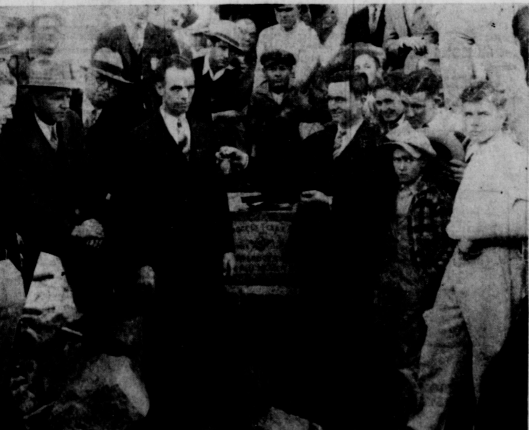
"The Big Event"

If You Know The Occasion or If You Can Name Any or All The People, Write The "Telegram" and Tell Us