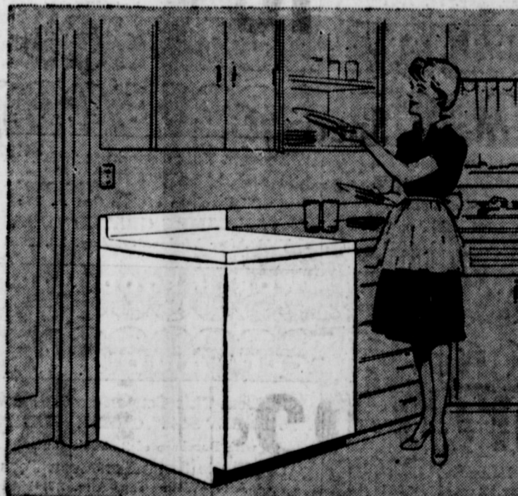
Table-top electric water heater provides extra work space in kitchen

An electric water heater is a real space saver. Because it's flameless and requires no flue, it can be installed anywhere—in a closet or unused corner, in the attic or basement or in a line of cabinets in the kitchen or utility room. With no flue to worry about, you can place it close to the point of greatest use, eliminating long pipe runs and resultant heat waste due to water cooling in the pipes. You'll have plenty of hot water for every need, too. New quick recovery electric water heaters heat water as fast as you use it. And you'll find electric water heating is clean, odorless, noiseless and completely safe because it's flameless! See the new quick recovery electric water heaters at your dealer's soon.