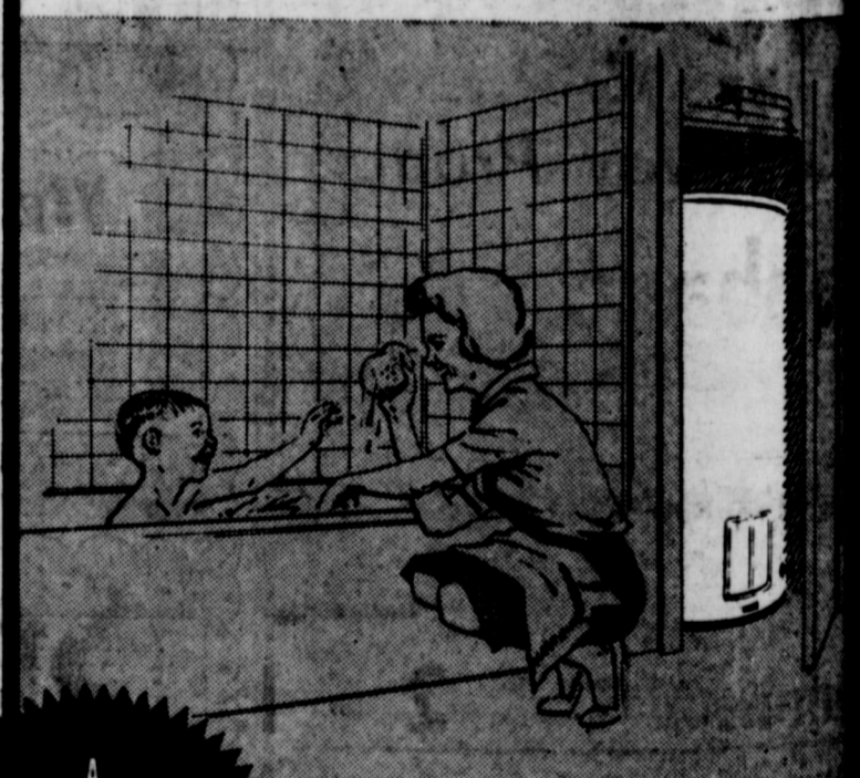
Round model electric water heater installed in bathroom linen closet

An electric water heater is a real space saver. Because it's flameless and requires no flue, it can be installed anywhere—in a closet or unused corner, in the attic or basement or in a line of cabinets in the kitchen or utility room. With no flue to worry about, you can place it close to the point of greatest use, eliminating long pipe runs and resultant heat waste due to water cooling in the pipes. You'll have plenty of hot water for every need, too. New quick recovery electric water heaters heat water as fast as you use it. And you'll find electric water heating is clean, odorless, noiseless and completely safe because it's flameless! See the new quick recovery electric water heaters at your dealer's soon.