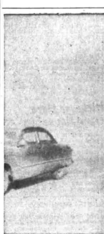
Dust Slows Traffic Colorado Highway Patrolmen set up a roadblock on U. S. Highway 36-40 near Aurora, just east of Denver, to warn motorists to drive slowly because of the low visibility resulting from blowing dust. Great clouds of powdered brown soil filled eastern Colorado skies as high winds swept across the area.