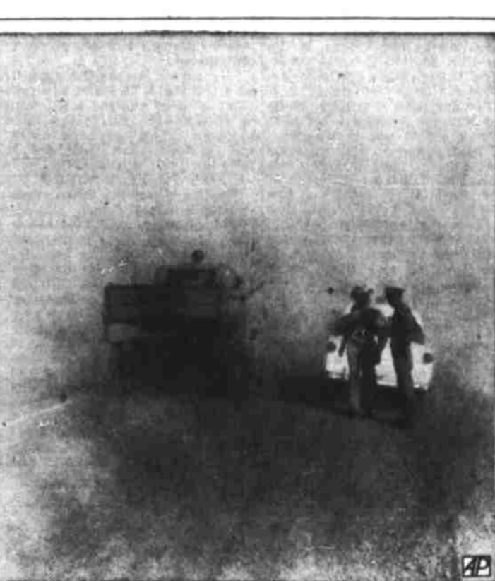
Dust Slows Traffic Colorado Highway Patrolmen set up a roadblock on U. S. Highway 36-40 near Aurora, just east of Denver, to warn motorists to drive slowly because of the low visibility resulting from blowing dust. Great clouds of powdered brown soil filled eastern Colorado skies as high winds swept across the area. (AP Wirephoto).

DALLAS (AP)—The new president of the Sigma Delta Chi in Texas is Mac Roy Raser, of The Associated Press staff at Austin.