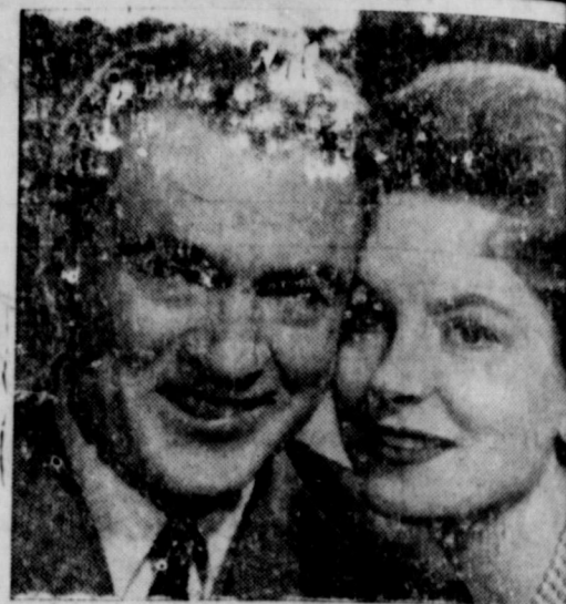
Gary Cooper and Deborah Kerr are shown here in the suspense shocker, "The Naked Edge," opening at the Majestic Theatre. It is a Pennebaker-Baron production for United Artist release.