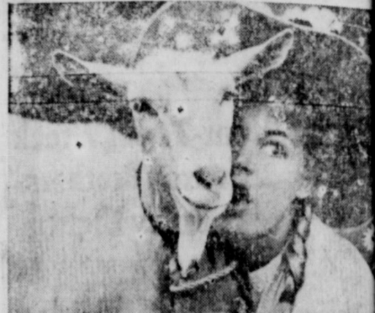
Pig-tailed Sandra Dee is the shantyboat-bred who yearns for a college education in "Tammy Tell Me True," romantic comedy in which her constant is Penelope, the cantankerous nanny goat. You co-stars with John Garvin in the Ross Hunter production for Universal-International Pictures.