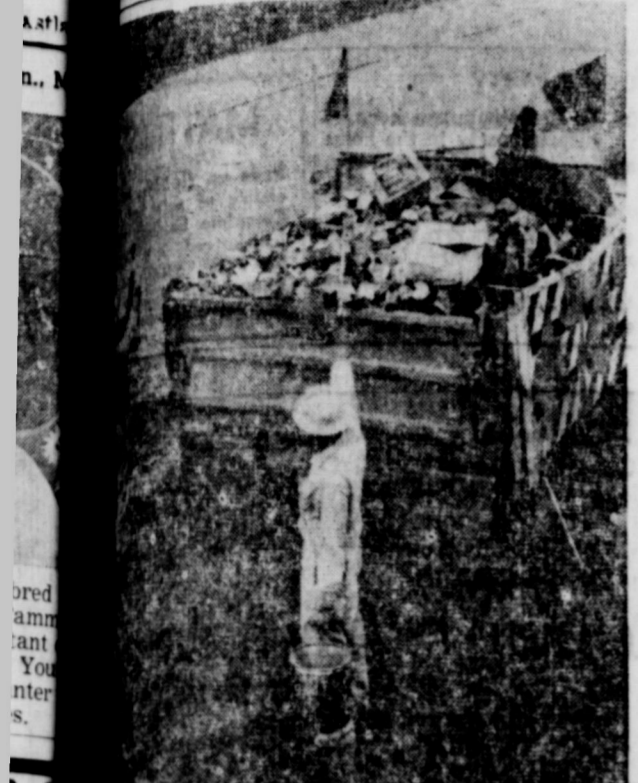
"DON'T TAKE IT WITH YOU" is the thoughtless attitude of litterbugs, who leave a trail of trash on the highways. Texas Highway Department maintenance crews clean up the mess as shown here. The Department asks that you dispose of your trash in proper containers. Please keep Texas highways clean for the enjoyment of others.