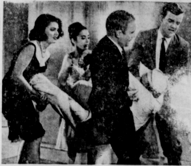
Paula Prentiss, Brigid Bazlen, Steve McQueen and Jim Hutton curt off Jack Weston, a sailor who has imbibed too freely, in this scene from Metro-Goldwyn-Mayer's "The Honeymoon Machine." The comedy revolves about U. S. Navy personnel stationed in Venice who use an electric computer in an attempt to break the bank at the local gambling casino. It's in CinemaScope and color.