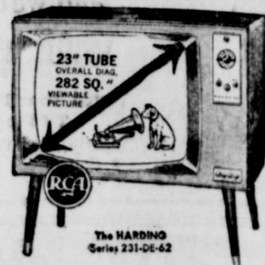
A "Double-barreled" value! Big, secure, 23" full picture screen, plus "No-Vibe" Tuner for better reception in many "fringe" areas!