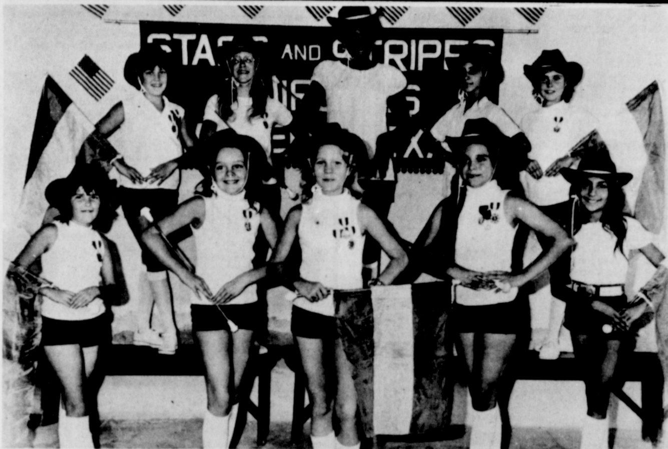
1974-75 Stars And Stripes