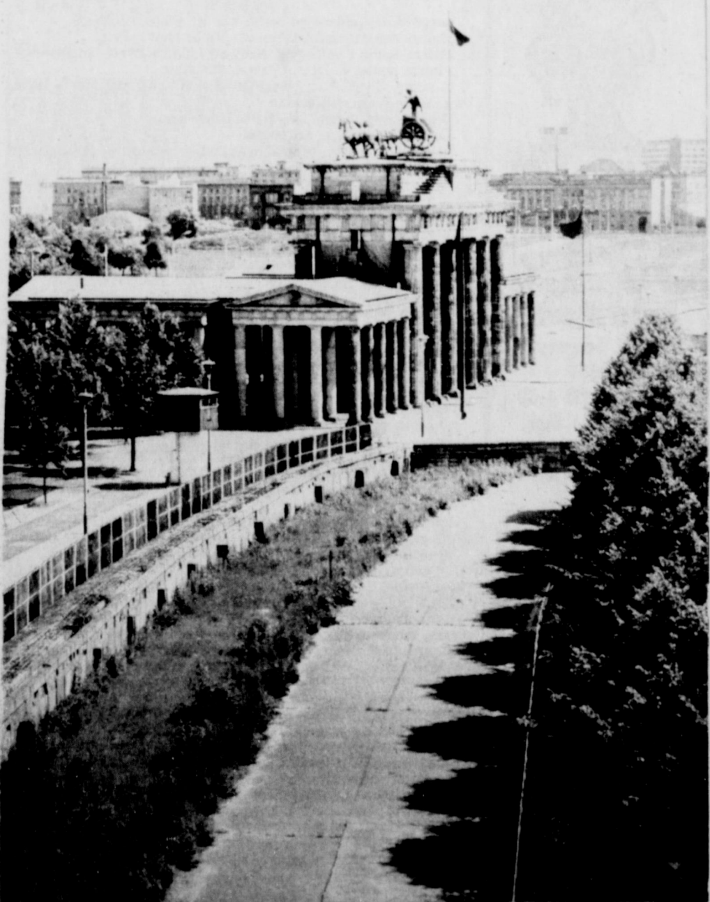
Brandenburg Gate ( Wall On Left)

S&W is located on the Leon Power Plant Road. Presently they have ten employees and are in need of several more experienced welders.