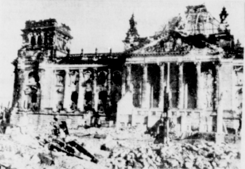
After The War