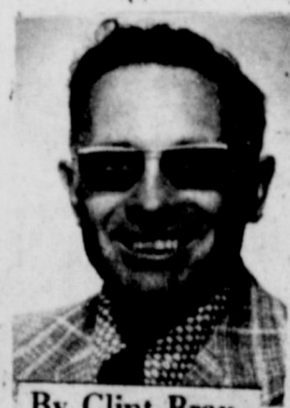
By Clint Bray

Usually, the fellow with money to burn ends up sifting through the ashes.