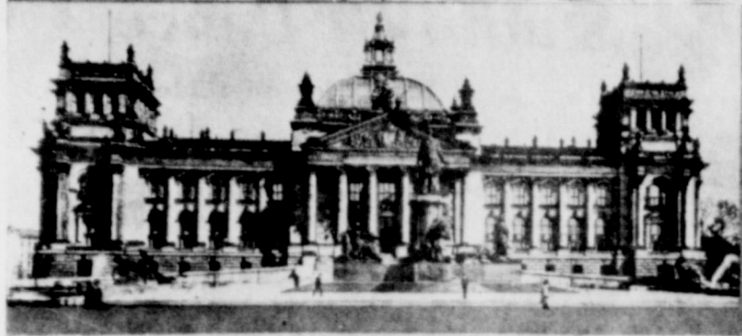
Reichstag Before The War

One thousand nine hundred and seventy-four at seven o'clock in the evening Bethel Baptist Church Eastland, Texas