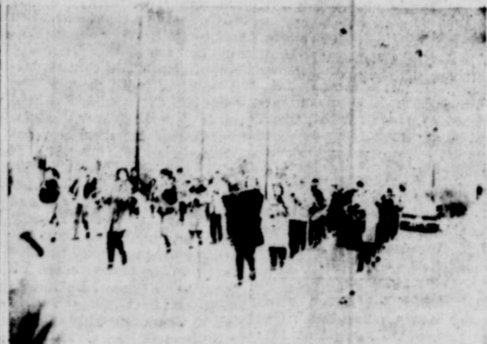
MAVERICK BAND — Here is the Eastland Maverick Band marching on one of the streets of Eastland in preparation for their Cotton Bowl trip to Dallas. The band returned late Wednesday night.

COPY MACHINE The Xerox machine is set up in this manner — the box at the right is used for preparing and producing the printing plate. In the center is the camera which takes the picture of the instrument leaning on the glass at the far left. The complete operation occupies eight or ten feet of space.