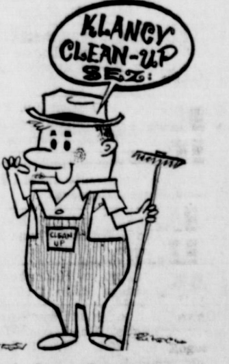
Don't forget Special Clean-Up Week Trash pick-ups begin Monday.