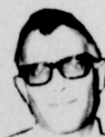
By Clint Bray

Personnel man to applicant: "Our incentive plan is quite simple. Make one mistake and you're through".