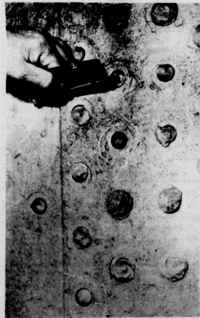
UP - CLOSE IT LOOKS BAD TOO - A workman demonstrates with a measuring device the bad condition of the interior of the giant tank.

The Eastland Jaycee-ettes will hold a bake sale on November 26, at JRB Grocery from 9 a.m. until 1 p.m.