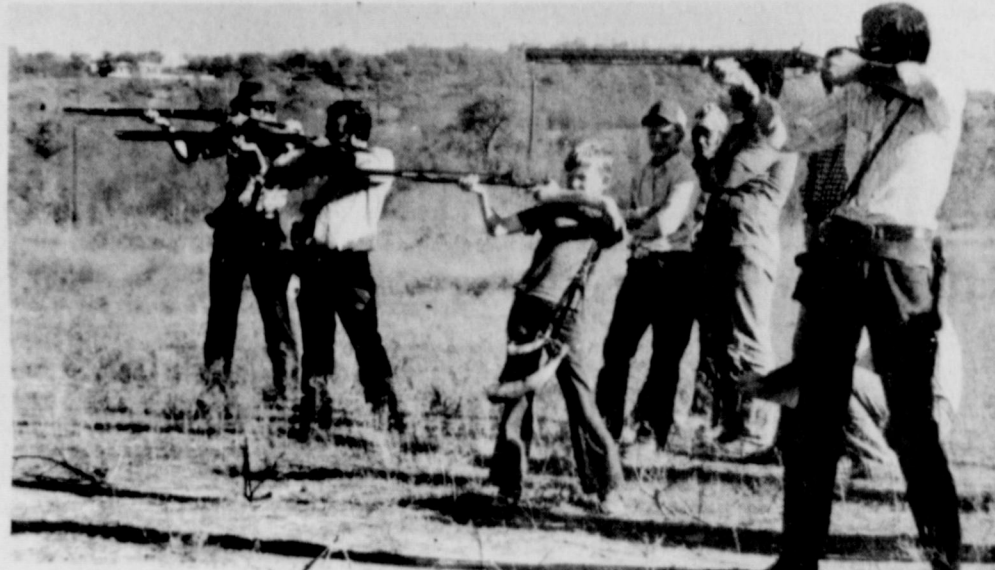
The Eastland Rifle and Pistol association received good attendance to their annual Turkey Shoot held this year at the range North of Eastland. Shooters from near and far attended the shoot. And a large number of Turkeys being awarded to the top marksmen. In the above photo, competition in the Muzzle loading rifle was being held.