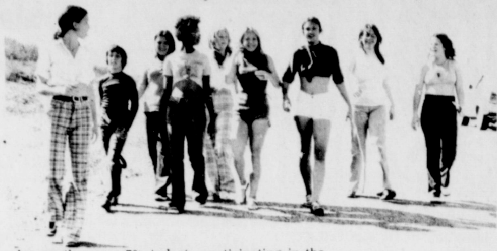
Among the some 70 students participating in the Bike - Hike for the retarded were these nine students from Eastland.