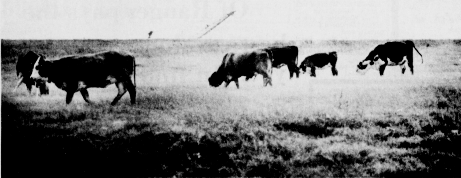
Cattle graze on reclaimed land near TESCO's lignite coal operation near Fairfield. Texas. The dragline used for