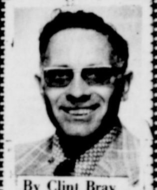
By Clint Bray

Remember the good old days, when it was teenagers who went through phases, instead of the economy?