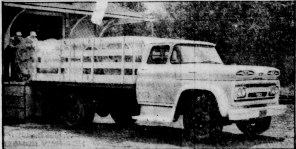
Continuation of the highly successful suspension system introduced last year, moderate front style changes, and refinements in chassis and cabs mark the 1961 Chevrolet truck line. Proved by one full year of customer use, the suspension features independent front springing with torsion bars and rear coil or variable rate springs. Cab improvements include a smaller floor tunnel in some models for increased leg and foot room, and an optional six-inch thick foam rubber seat.