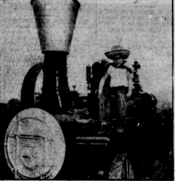
PRAIRIE EXPRESS—Tommy Lightner, 4, youngest member of the Midwest Old Settlers and Threshers Association meeting at Mount Pleasant, Iowa, rides a 68-year-old Case steam engine, one of 36 ancient workhorses which once powered threshing equip-ment on farms. The old-time puffers were brought from various parts of the midwest for entry in a horsepower contest.