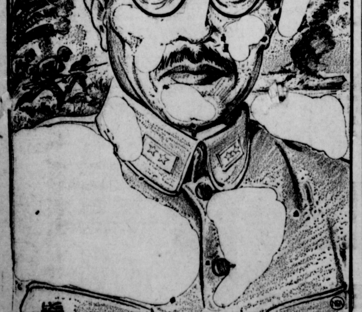
Anged, bespectacled, balding Gen. Hideki Tojo, premier of Japan since last October, is now virtually unchallenged as dictator, with his emperor a restrained figurehead and only military associates remaining in his cabinet. Tojo has behind him many victories by his little yellow warriors in the Asiatic jungles, but also is beset by a growing number of defeats like the sinking of his warships in the Pacific and the loss of the southern Solomons.