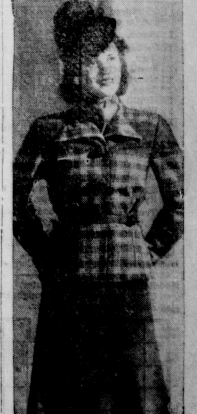
The warm muffled look comes up in style value as fuel supplies go down... hence a mounting fervor for costumes like this one. Handsome warm hues brown and rust, are combined with soft blue in the fine wool jacket. The tweed skirt is blue. So is the crushed-crown felt hat. The cross stripe of the jacket plaid is repeated in a fine wool scarf which heightens the warmly wrapped effect of the ensemble.