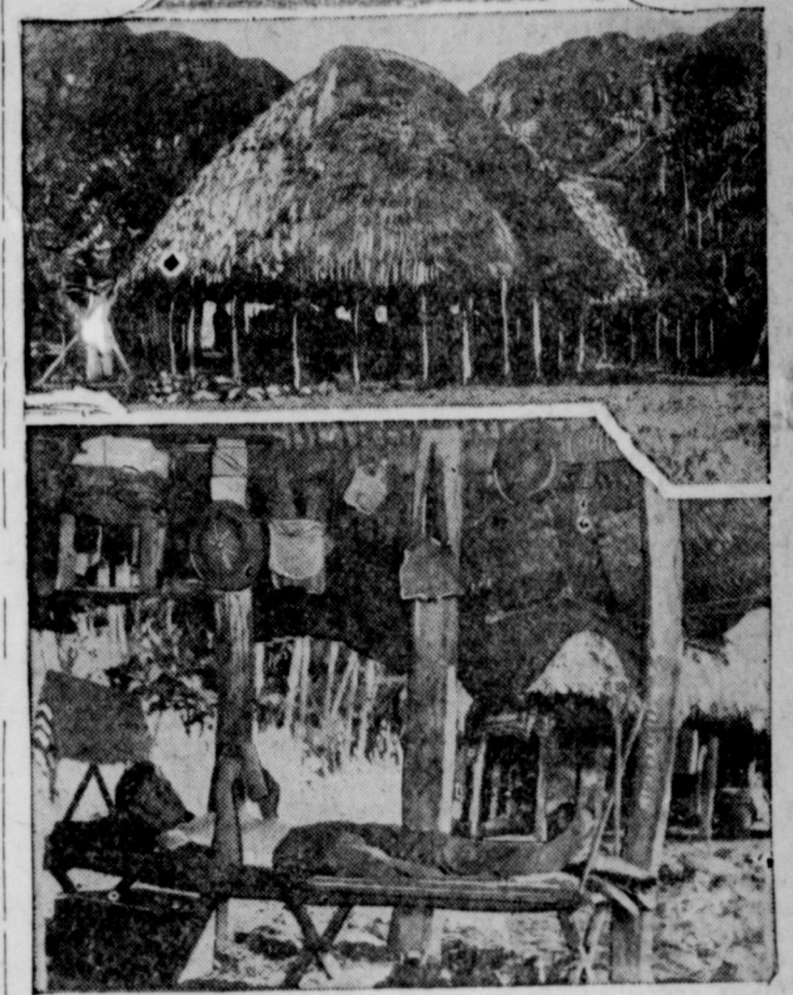
U. S. Marines on an un-named Pacific isle are quartered in barracks such as those pictured above. Below, a Leatherneck relaxes by reading up on his training regulations. The Devil Dogs have become steady holders of these native huts.