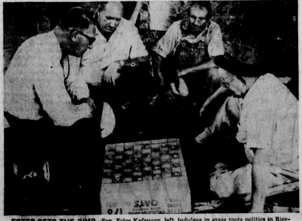
ESTES GETS THE JUMP—Sen. Estes Kefauver, left, indulges in grass roots politics in Riceville, Tenn., as he plays checkers using bottle caps. He won a hard fight for the Democratic nomination for re-election in the state.

Sen. Estes Kefauver, left, indulges in grass roots politics in Riceville, Tenn., as he plays checkers using bottle caps. He won a hard fight for the Democratic nomination for re-election in the state.