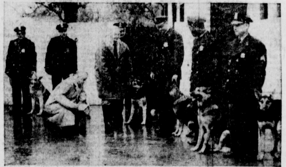
READY FOR ACTION—Policemen and their dogs line up for inspection in Washington, D.C. They comprise the district's first canine corps—used to flush out and apprehend burglars and other criminals.

EASTLAND NATIONAL BANK "On The Square" Member F. D. I. C.