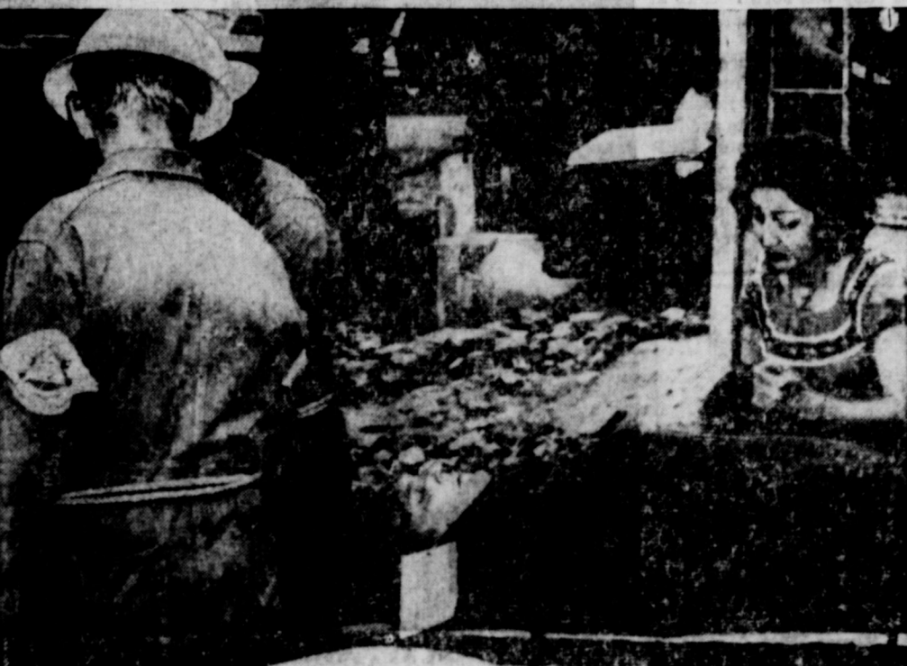
REALISTIC MEDICAL exercises by local civil defense units such as this one at Los Angeles build up a preparedness to meet nuclear attack or natural disaster. Only through such training as this can the nation be ready to care for the millions of casualties that might result from nuclear attack.

Pearson forecast an excellent business year for 1960, with recovery from the effects of the steel strike to be relatively slow, but picking up momentum afterwards. Personal incomes should reach new highs, he said, with consumer expenditures expanding accordingly. While housing starts possibly would decline to roughly 1.2 million units from 1959's estimated 1.35 million units, the year would still be one of the best post-war building years, he concluded.