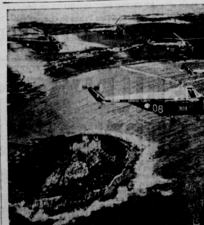
OLD AND THE NEW—Helicopters of Britain's Royal Navy churn the air over an historic backdrop, St. Michael's Mount with its ancient castle off Cornwall.

EASTLAND NATIONAL BANK "On The Square" Member F. D. I. C.