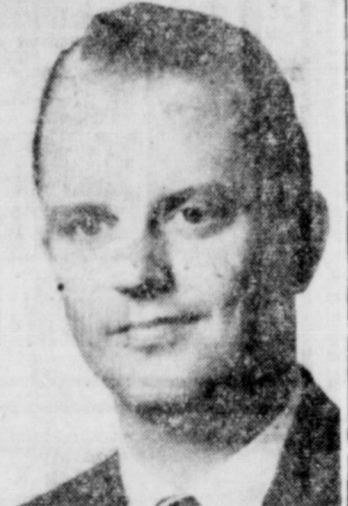
new telephone manager

EASTLAND NATIONAL BANK "On The Square" MEMBER F. D. I. C