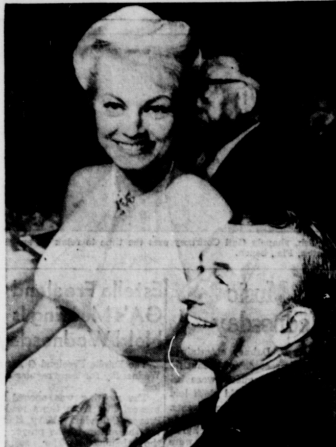
ROMAN HOLIDAY — Swedish actress Anita Ekberg and Italian fashion designer Emilio Schubert smile it up in Rome, Italy. Scene was an award party in which he received recognition for his fashions created for television shows.