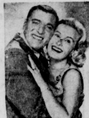
AT MAJESTIC—Academy Award winner Burt Lancaster and Dina Merrill star in "The Young Savages" which opens at the Majestic Theatre, through United Artists release Thursday.