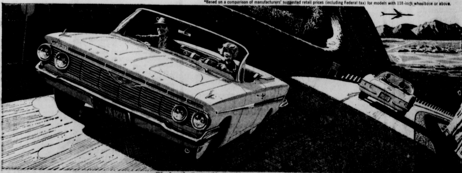
The Impala Convertible and the new Corvette—two of 31 models awaiting your pleasure at your Chevrolet dealer's

See the new Chevrolets at your local authorized Chevrolet dealer's One-Stop Shopping Center