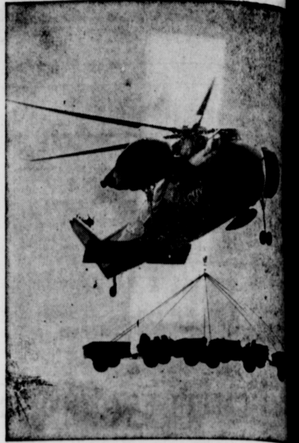
TWO JEEPS AND TWO TRAILERS suspended on a large air transported by the Mojave, Army's medium transport helicopter. Sling loading of equipment provides a tremendous savings in time for both loading and unloading in air operations. The Mojave H-37 twin-engine helicopter is produced by Sikorsky.