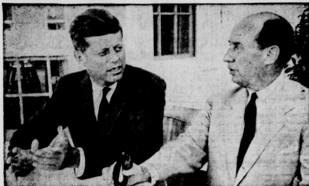
HYANNIS PORT CONFERENCE—Sen. John Kennedy, Democratic nominee for president, confers with Adlai Stevenson at Kennedy's home at Hyannis Port, Mass. Stevenson has been mentioned as possible secretary of state in the event of a Democratic victory.