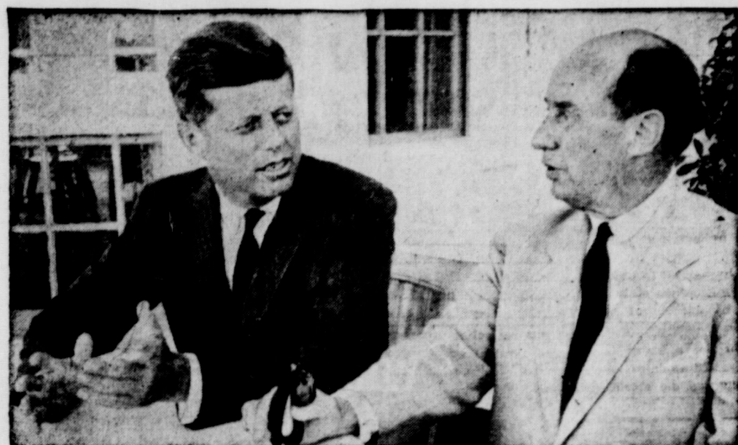
HYANNIS PORT CONFERENCE—Sen. John Kennedy, Democratic nominee for president, confers with Adlai Stevenson at Kennedy's home in Hyannis Port, Mass. Stevenson has been mentioned as possible secretary of state in the event of a Democratic victory.