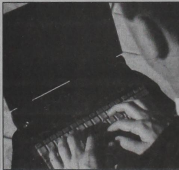
What You See Today