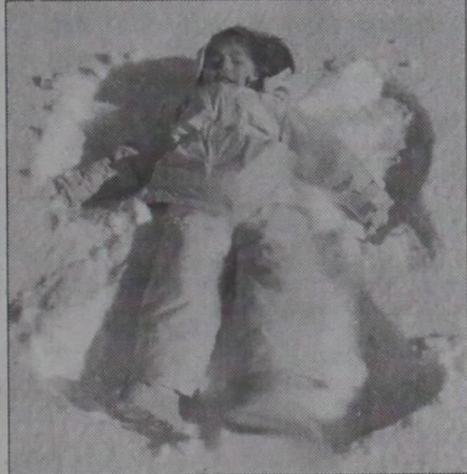
Stormie Meriwether makes snow angel.