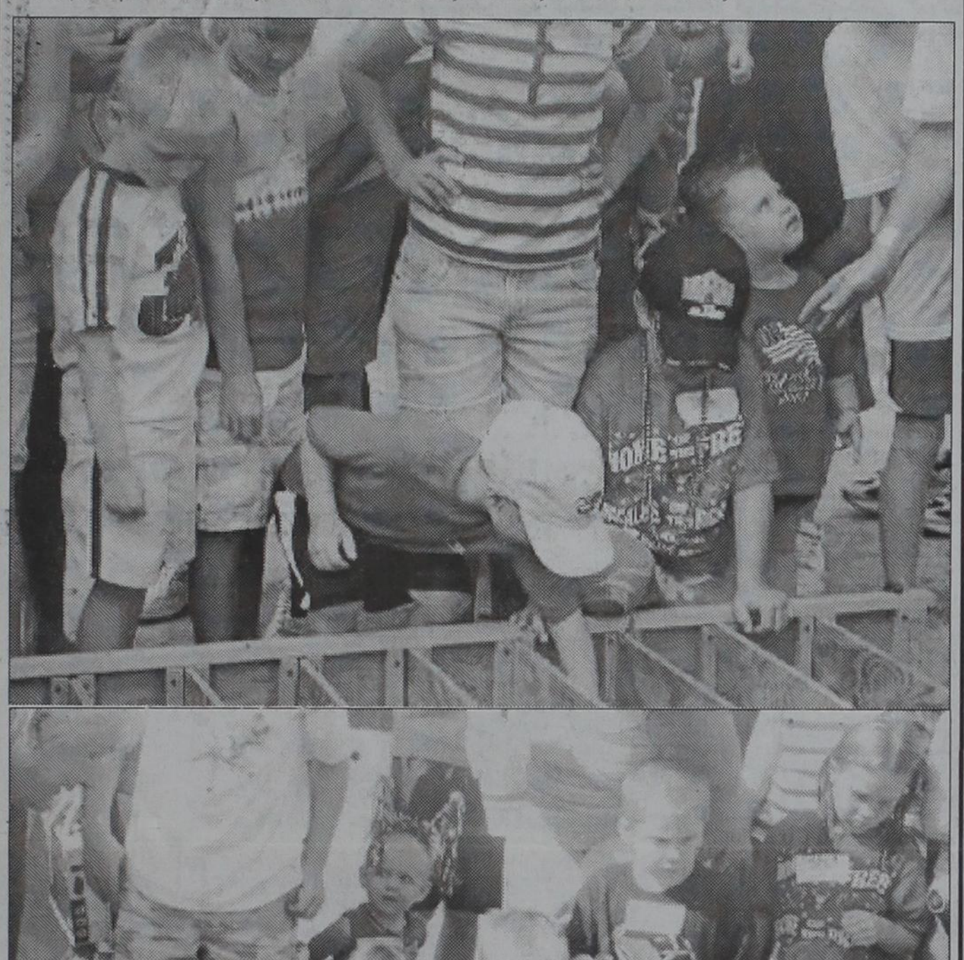
The 4th of July turtle race draws so many participants, the race had to be divided into heats.