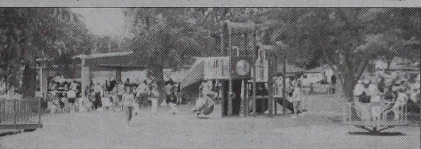
A large crowd at the city park on July 4, 2007