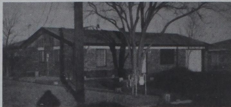
#101 Three bedroom, two bath brick home. Fenced yard with storage building. 514 Osage