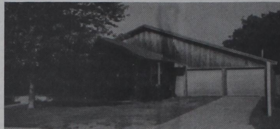
#108 Large three bedroom, 2 bath home with one fireplace and one wood stove, two living areas, an office, cellar & double garage. Owners have been transferred 510 S. Reynolds