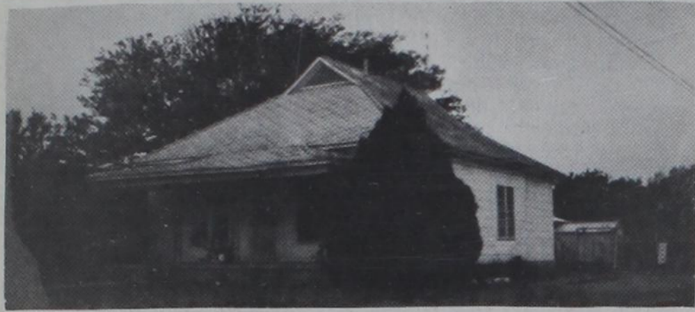
#107—Two Bedroom, one bath frame home with fenced yard. Owners moving—Priced to sell quickly—704 Main Street.