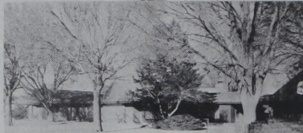
#75—Extra large Three bedroom, 2 3/4 bath brick home on large lot with lots of storage.—605 S. Stanley

#100 Three bedroom 1 3/4 bath brick home with fireplace, double garage, fenced yard on paving.