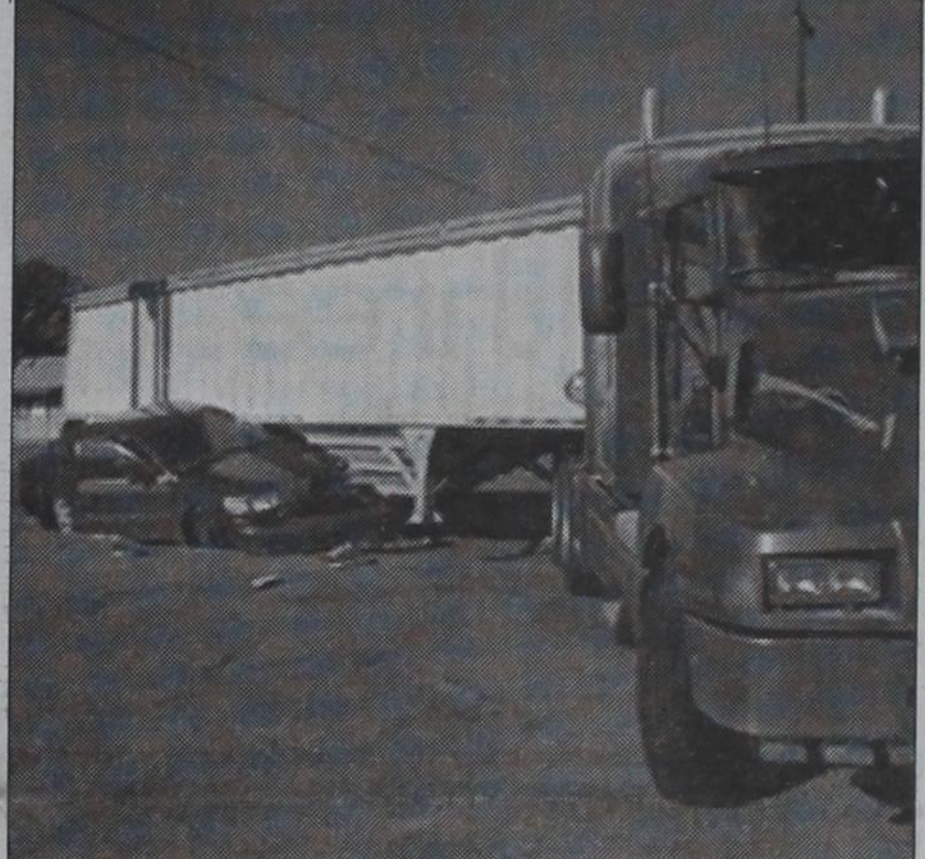
COLLISION: A couple from Kansas occupied this vehicle which was struck by a truck in the 300 block of Alan L. Bean Blvd. The accident occurred Friday morning when the truck made a right hand turn into Omega Grain. The car in the right lane of traffic was apparently out of the sight of the driver. The car was run over by the trailer. There were no injuries from the accident.