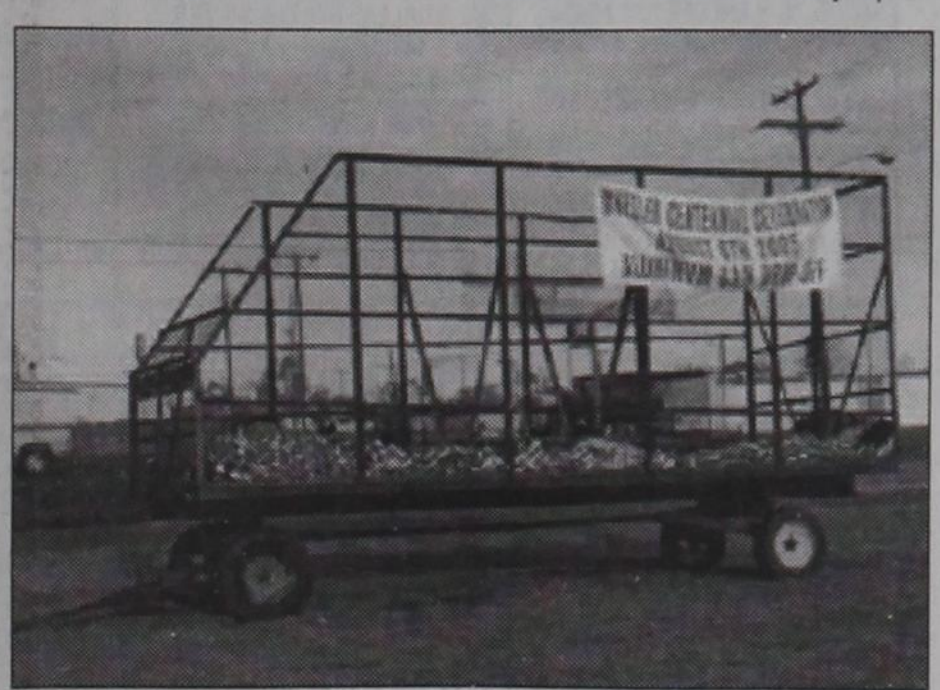
SAVE YOUR CANS: The trailer is in place and the saving of cans is in full swing. The cans are being collected for Wheeler's Centennial Celebration in 2005. The trailer is located in the 400 block of Sweetwater St.—Thriftway parking lot. Individually, can collection does not add up, but as a community it works.