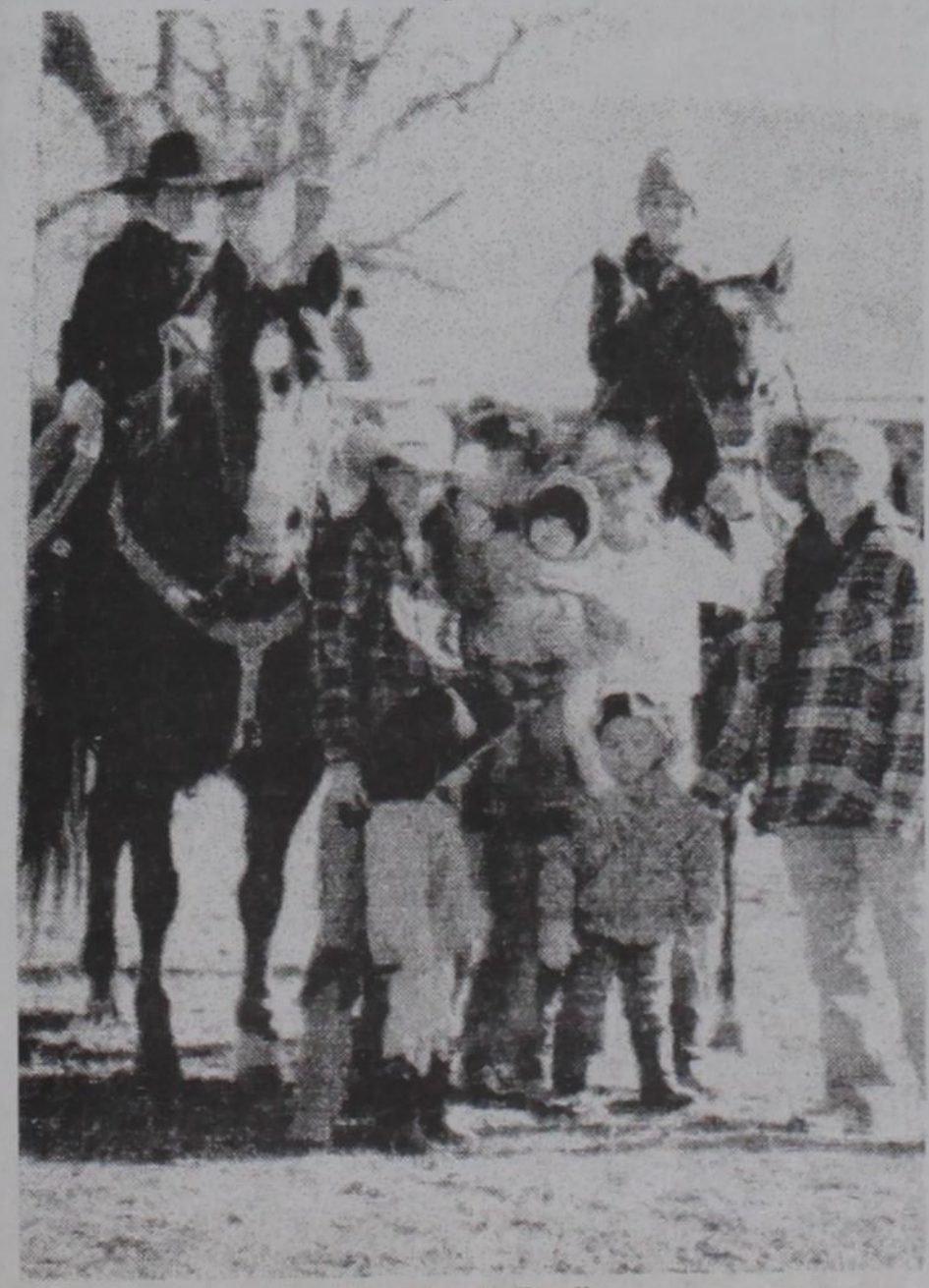
The Adcock Family