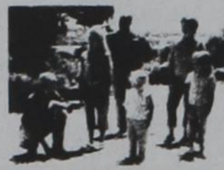
KELLER FAMILY WORSHIP TEAM