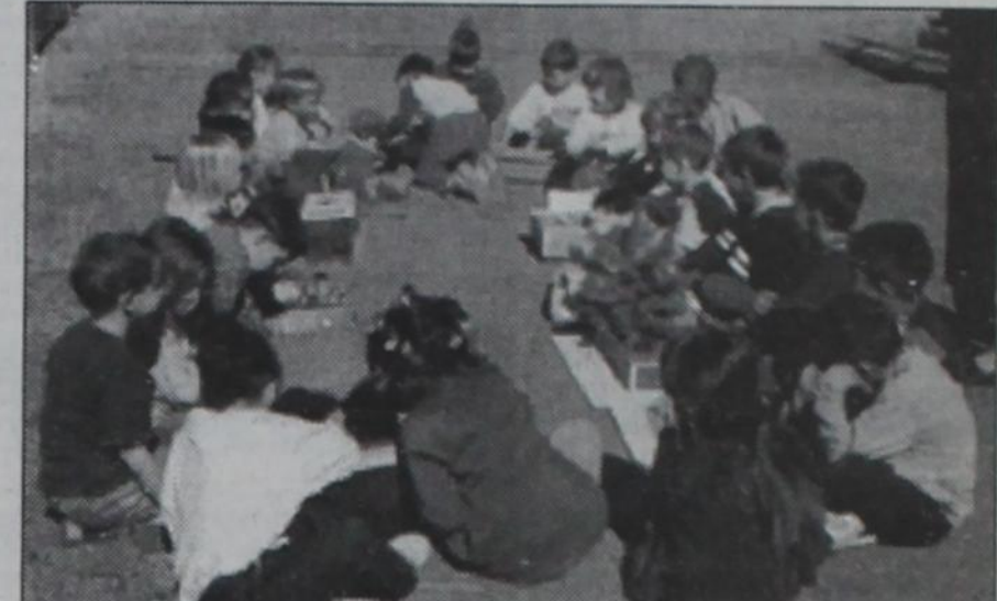
Wetlands: Pre-K and Kindergarten students at Kelton show off their habitat projects, learning different kinds of animals of the earth.

PAGE 3—Thursday, February 27, 2003 Wheeler, town of friendship and pride