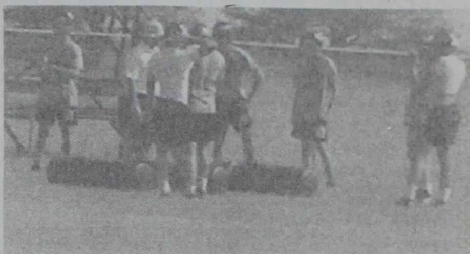
PRACTICE MAKES PERFECT: The Ft. Elliott Cougars can be found on the football field these days practicing for what is hoped to be a successful season. The cooler weather is certainly appreciated by the athletes.