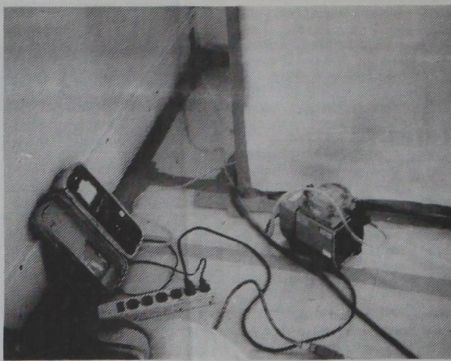
EQUIPMENT: The first phase of the Wheeler County Courthouse restoration is the removal of the asbestos. Asbestos can be found in the adhesive used in applying the tile on the floors and some can be found around the old heating system. Here shows just some of the equipment being used to keep check on the air in the structure.