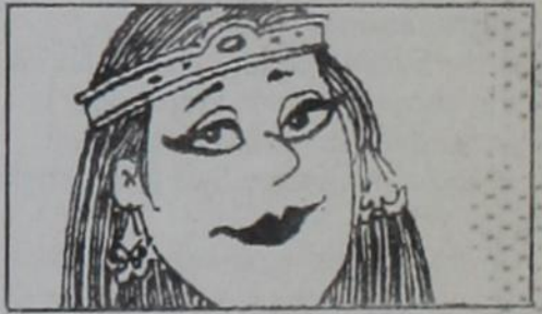
The first name of the Queen of Sheba was Balkis.

Consumers can receive a copy of the booklet by sending ten (10) first class stamps for printing, postage and handling to: New Era Survival Research Institute, NBC Survival Booklet Offer #NBC1010, P.O. Box 60944, Washington, DC 20039-0944. Additional information is available by calling the organization's headquarters at 202-882-9000 or on the Internet at: www.NewEraSurvival.org