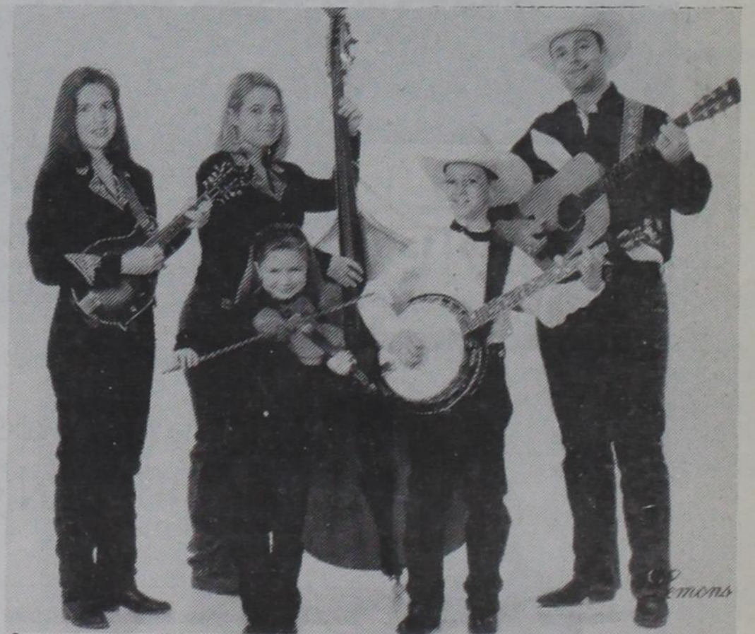
THE DUFFIN FAMILY

The Duffin Family is one of several bands to be appearing at the Old Mobeetie Music Festival July 27, 28 & 29, 2001.