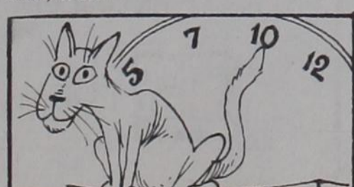
The majority of cats weigh between seven and twelve pounds.

MONDAY: Lunch; Fish, French fries, cole slaw, hush puppies, milk, ice cream. TUESDAY: Lunch; Taco salad, lettuce, cheese, tomato, milk, fruit cobbler. WEDNESDAY: Lunch; Country fried steak, mashed potatoes, green beans, hot rolls, milk, banana pudding. THURSDAY: Lunch; Beans, potato salad, spinach, corn bread, milk, chocolate sheet cake. FRIDAY: Lunch; Ham & cheese sandwiches, lettuce, tomatoes, chips, milk, fruit.