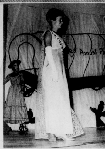
THE MULESHOE JAYCEES