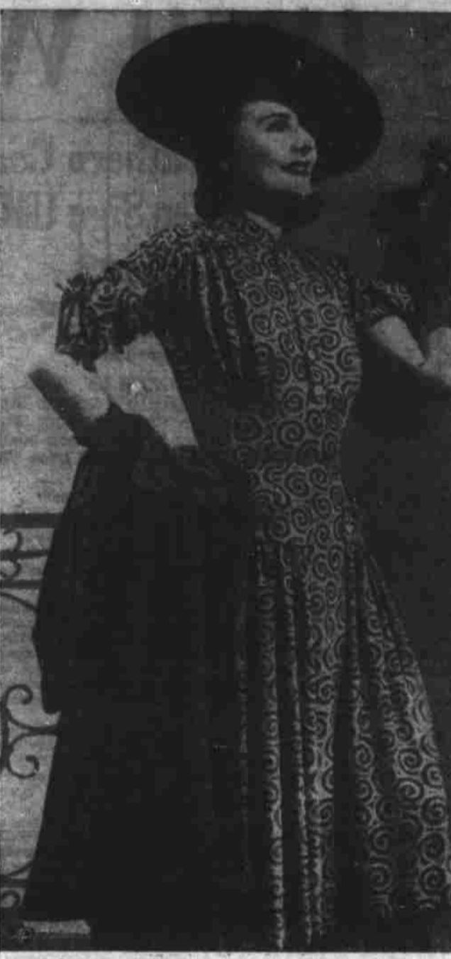
Prints are scheduled as heavy favorites for warm weather. This one, from Paris, has a gray crepe ground covered with raspberry scrolls.