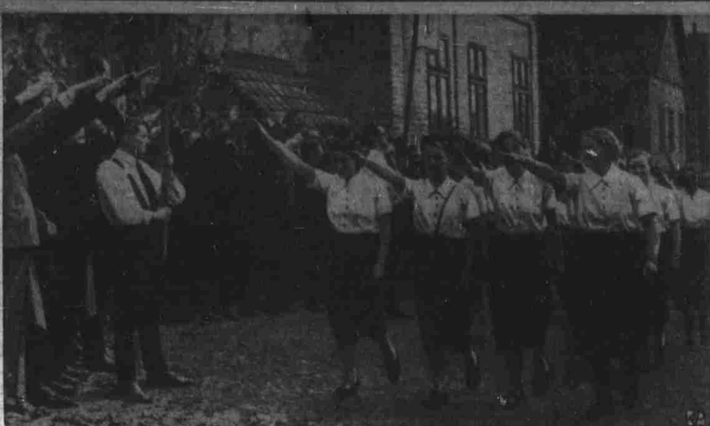
THE TIE THAT BINDS Hitler-influenced Hungarians to the Nazi government in Berlin is evidenced by the marching drill of these Hungarian women, shown learning the stiff-arm salute favored by both dictator nations, Germany and Italy.

NEW ORLEANS, May 17 (AP)—Although expressing belief that American oil deposits were "definitely limited" E. DeGolyer, Dallas, Texas, prospector, predicted today that the average man would not live long enough to "see the arrival of that oft-predicted day of